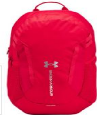
UA Hustle 6.0 Team Backpack